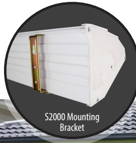
S2000 Mounting Bracket