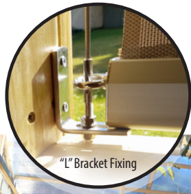
"L" Bracket Fixing