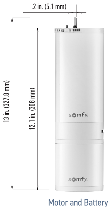
Motor and Battery